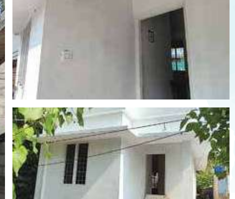
HOMES OF COMPASSION.