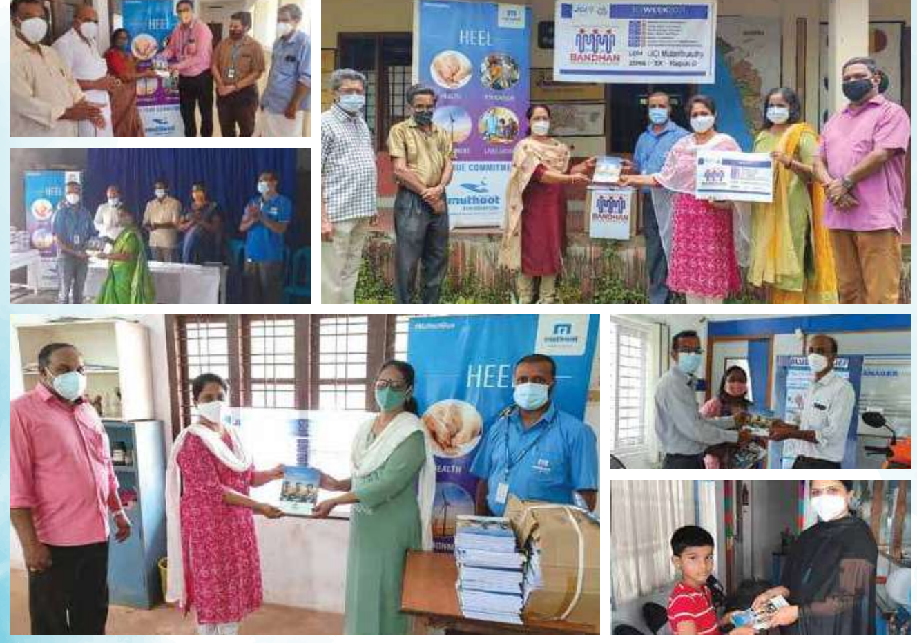
EDUCATION SUPPORT TO CHILDREN; LAYING THE FOUNDATIONS OF LIFE.