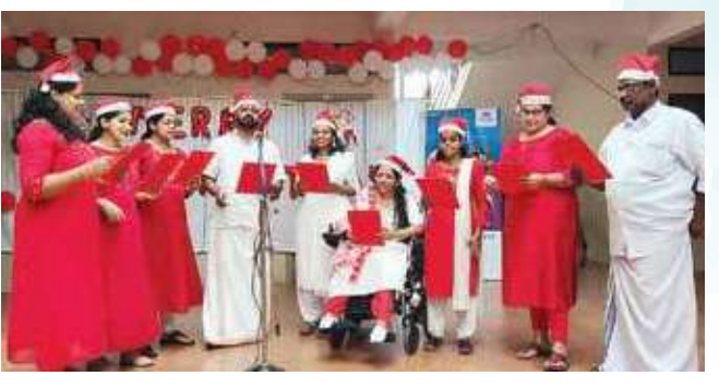
A FUN-FILLED CHRISTMAS AT AASHIANA.