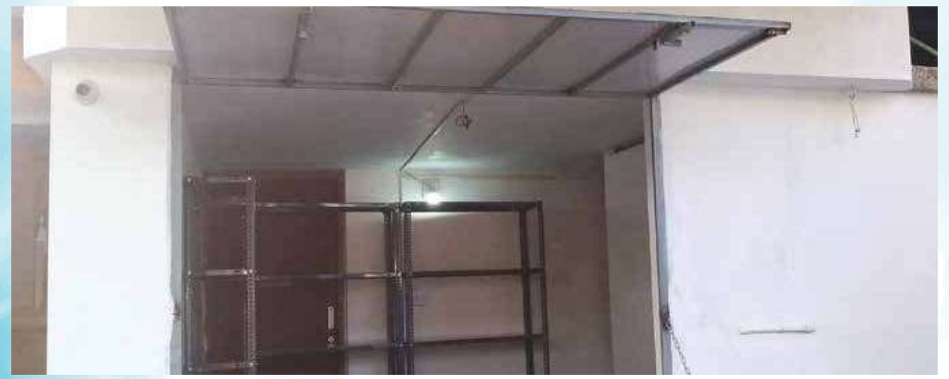
SUPPORTING LIVELIHOODS, BUILDING RESILIENCE.