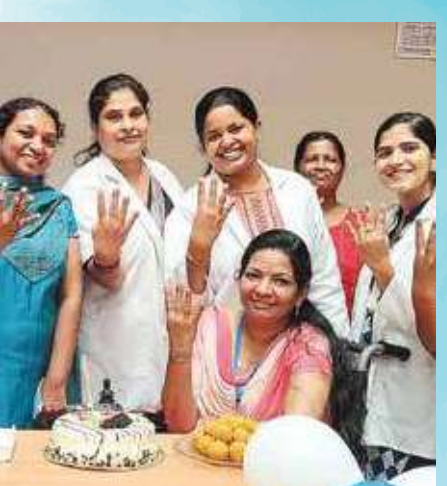
CELEBRATING MILESTONES OF LOVE AT AASHIANA. Birthday celebrations at the rehabilitation centre.