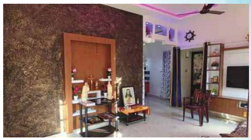
RENOVATING HOPES, REINFORCING FOUNDATIONS.