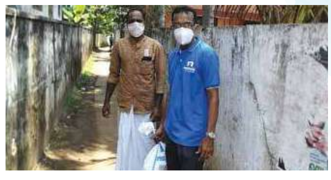
Help extended during COVID-19 lockdowns.