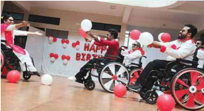
ENGAGING PATIENTS WITH QUALITY OF CARE. Competitions at Aashiana.